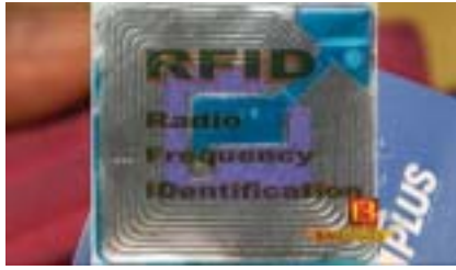
Radio Frequency IDentification