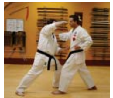
Double punch head and middle.