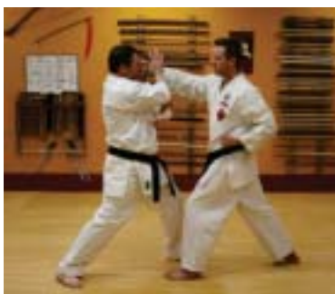
Block the reverse punch.

As the jab comes in hari uke and shuto the ribs, then shuto the neck.