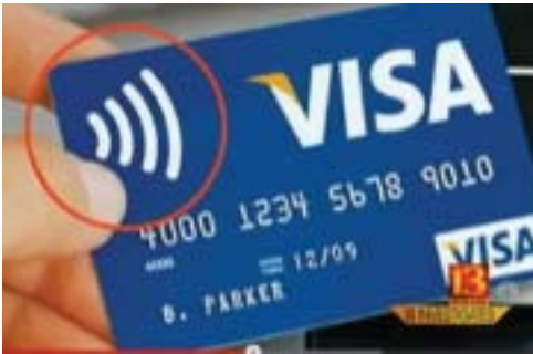
All cards that have this symbol have this technology.