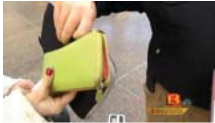
The wallet is scanned by a concealed card reader.