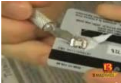
If you have a chip you could be at risk, debit or credit card it doesn't matter.