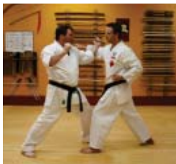
Circle the hands and clear the reverse punch off.