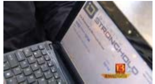
Your card information shows up on the thieves pc.