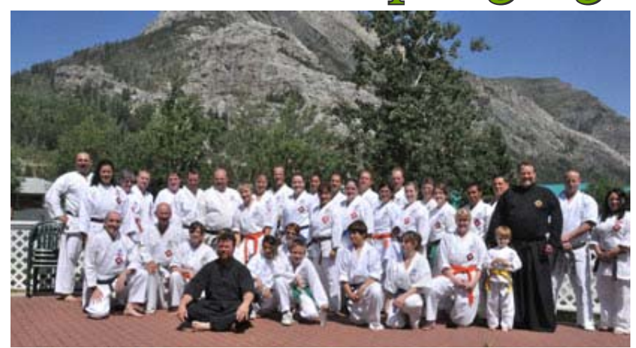
The CMAC West Campers