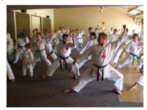
Training a new form called Jin